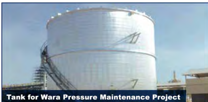
Tank for Wara Pressure Maintenance Project