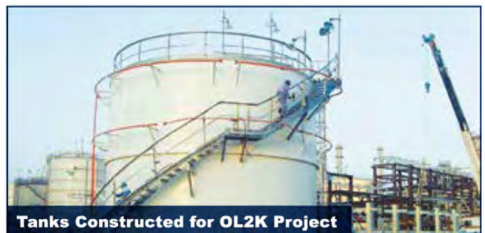
Tanks Constructed for OL2K Project