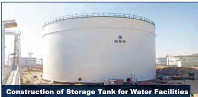
Construction of Storage Tank for Water Facilities