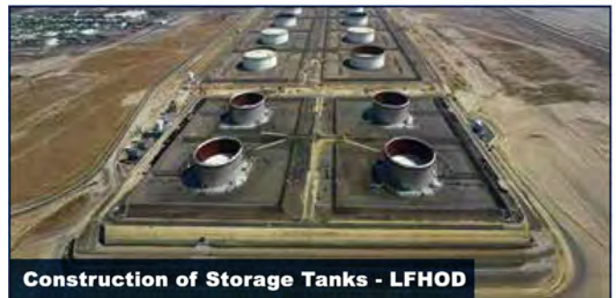
Construction of Storage Tanks - LFHOD