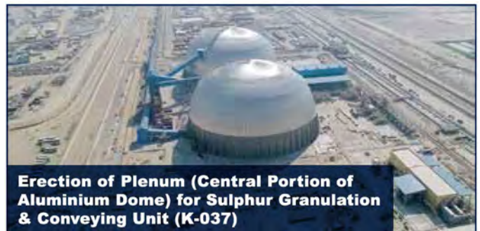
Erection of Plenum (Central Portion of Aluminium Dome) for Sulphur Granulation & Conveying Unit (K-037)