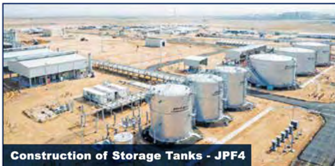
Construction of Storage Tanks - JPF4