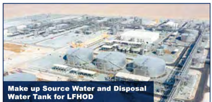
Make up Source Water and Disposal Water Tank for LFHOD